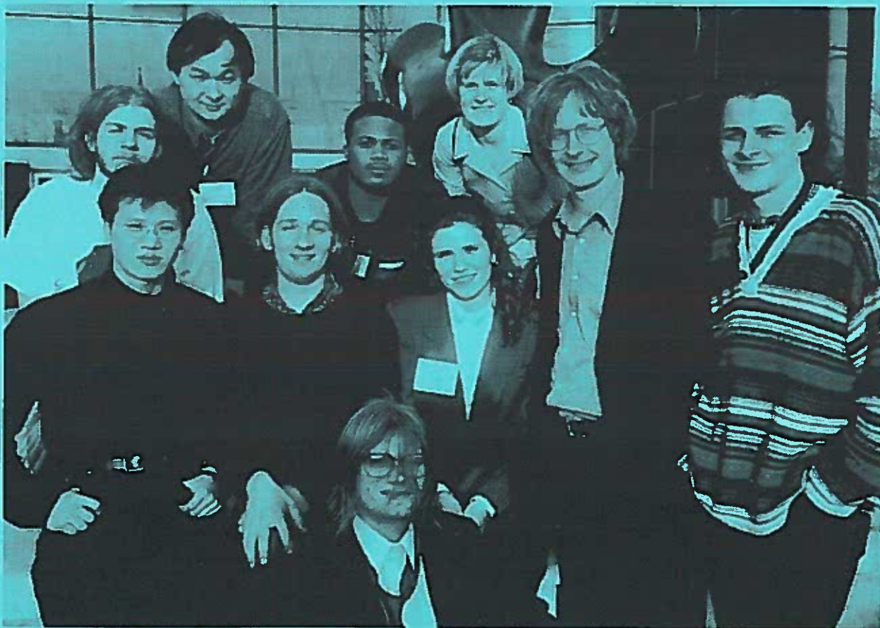
1998 Saxophone class at the Northwestern University NASA Convention. (March 1998)