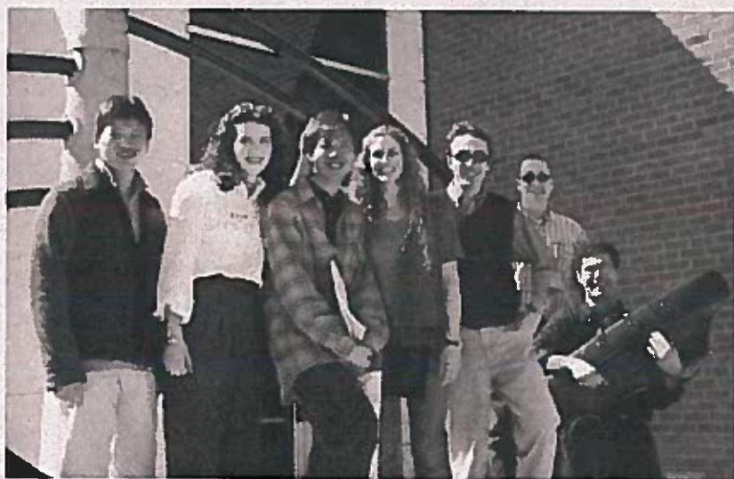
Saxophone class and alumni at the Biennial 2000 Convention in Tucson, Ariz.