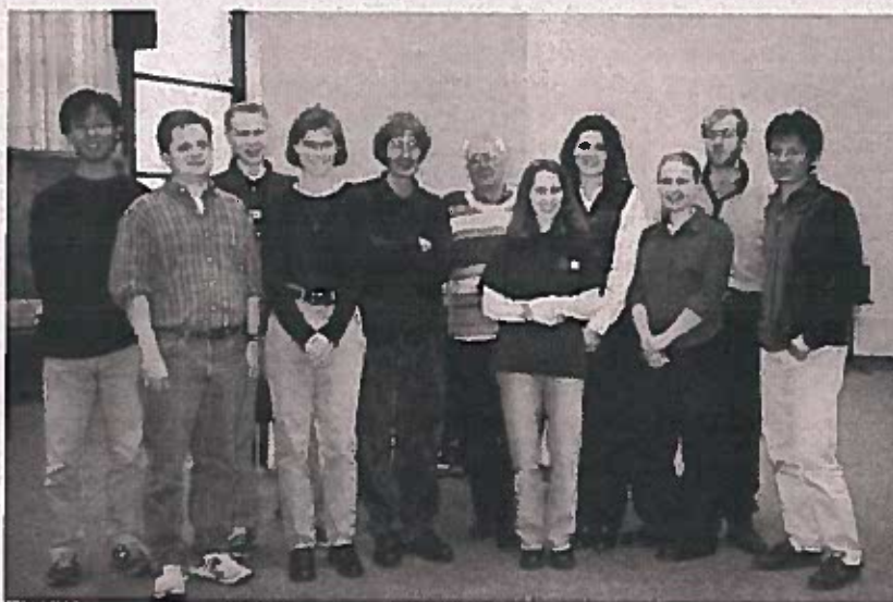
Saxophone class with composer Bernard Rands