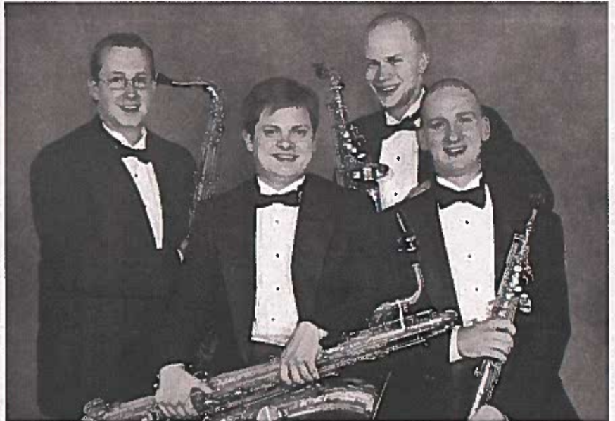
Lithium Saxophone Quartet Gold Medal winners at Fischhoff