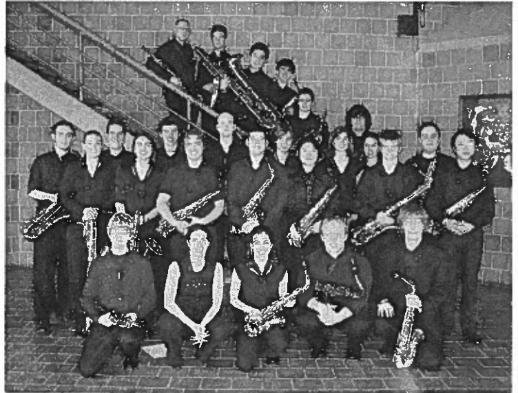
"Saxophobia Concert" with the BGSU Saxophone Class of 2004/2005