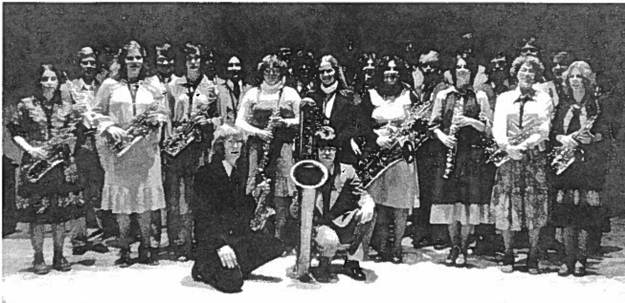
BGSU Class of 1979 (Free CD for the person who recognizes the most names in the photo)