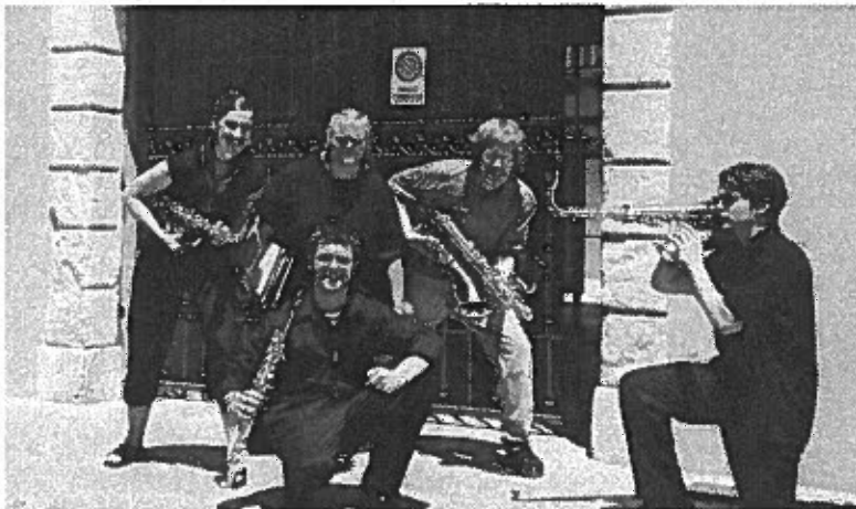
The Riva Quartet "On The Street" in Italy