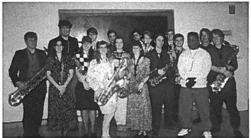
Musicians at performance of Cage's Four s at the Art Gallery – 1994