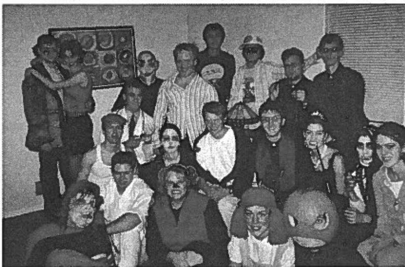
2003 Halloween Party