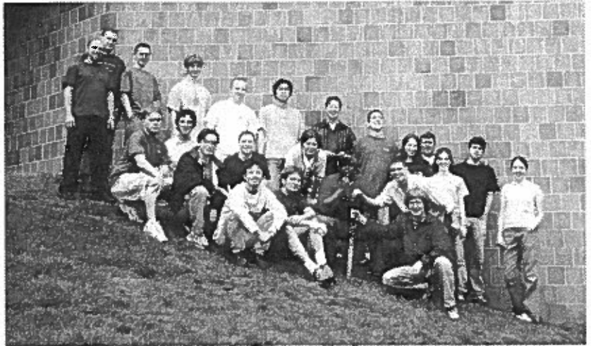
2002 Softball Saxophone Team