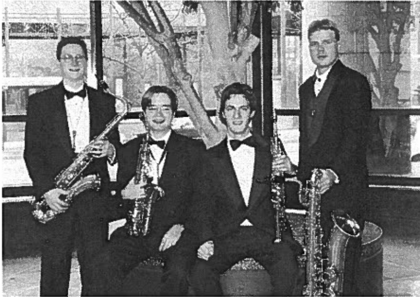
Bohica Saxophone Quartet