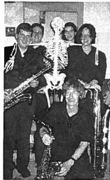
"Making Friends" in Florence