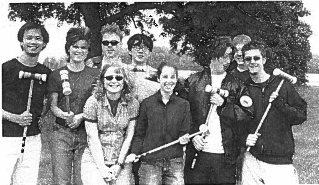
"Cut throat" Croquet